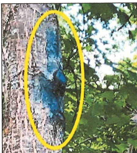
If an oak tree is pruned, cut or otherwise damaged between April and mid-July, intentionally or not, it is best to carry latex tree wound paint in order to cover the wound immediately.

“In most cases, winter is the best time for pruning oak trees, anyway,” shared Scanlon. “After the leaves fall, it's easier to see the branches that need work and ensure nothing is missed.”