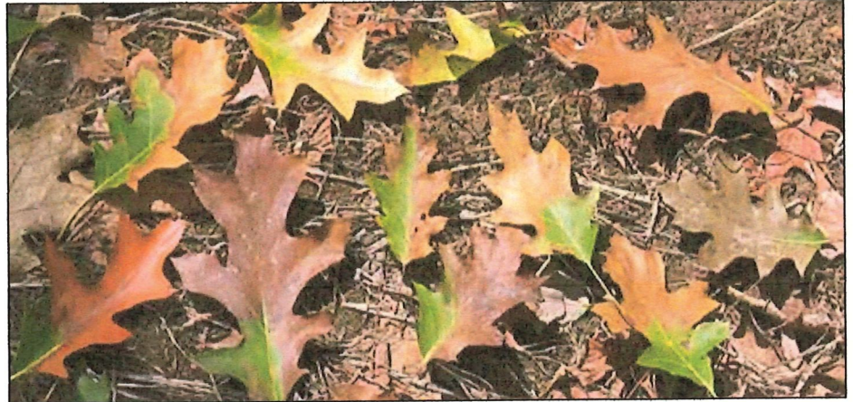
Fallen leaves from a tree infected with oak wilt show a dull green and bronze coloration and will appear water-soaked but partially green. Trees in the red oak family that are infected with oak wilt will die during late summer or early fall of the same year that they are infected.

Then, when beetles sense a nearby tree has suffered a wound, their attention quickly shifts as they buzz